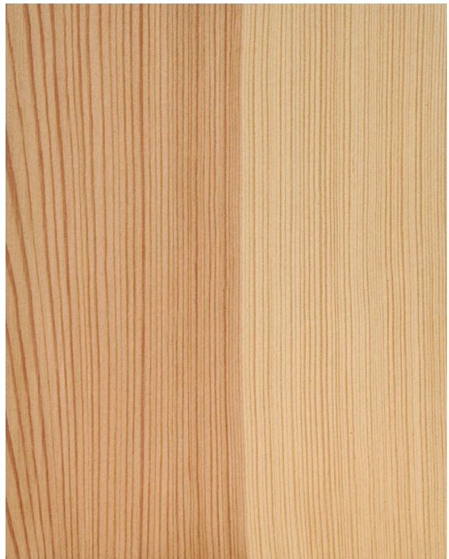
Wood surface of pine (radial section)